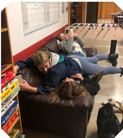
Top: Welcome BBQ in the park